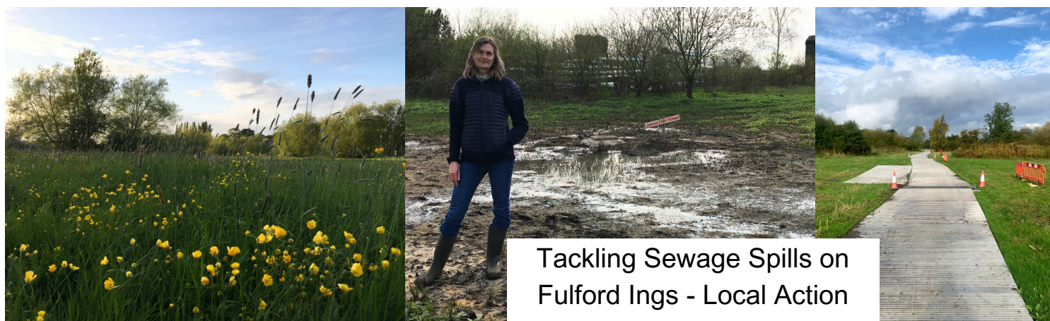
Tackling Sewage Spills on Fulford Ings - Local Action